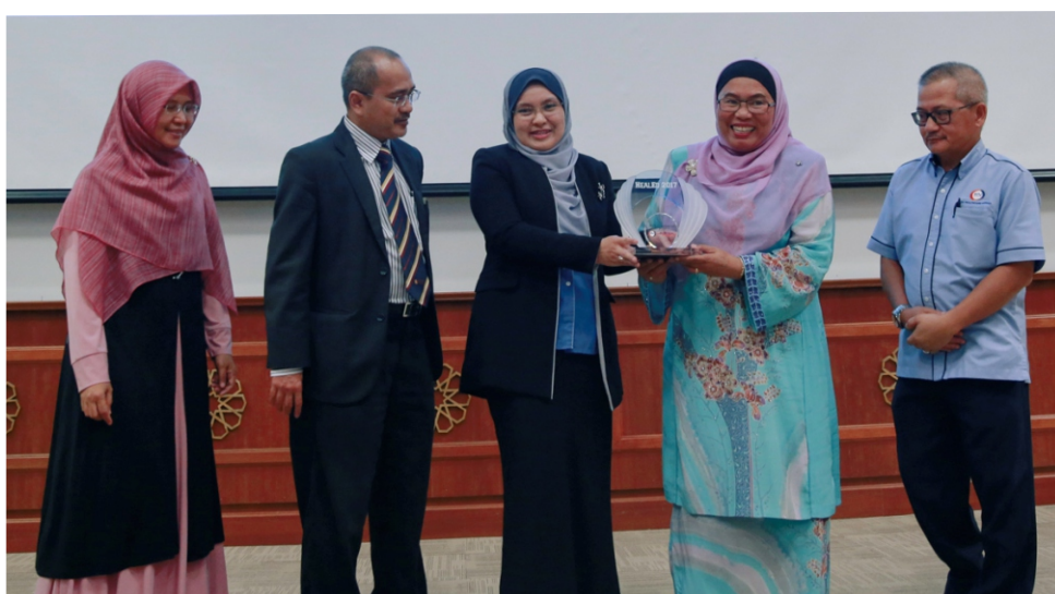
Presentation of souvenirs from KPJ Sentosa KL Specialist Hospital to Pro-Vice Chancellor of UTM Kuala Lumpur Campus

Supporting this motion and understanding the importance of creating the awareness of this disease, KPJ Sentosa KL Specialist Hospital, in collaboration with the Azman Hashim International Business School of Universiti Teknologi Malaysia (UTM AHIBS) launched HealEd 2017.