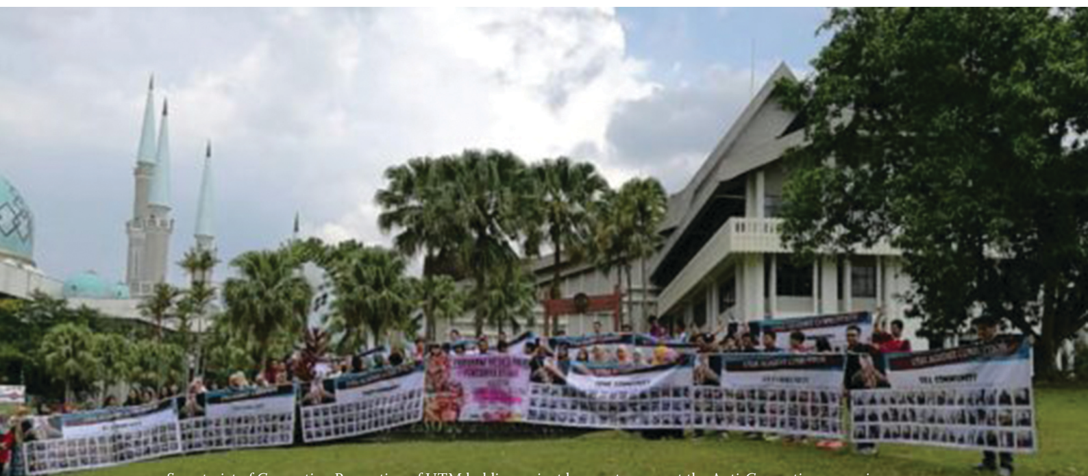
Secretariat of Corruption Prevention of UTM holding a giant banner to support the Anti-Corruption campaign

Corruption is a very real threat to society, and UTM is committed in ensuring its staff and students are aware of the dangers and the consequences of corruption both to themselves and to society.