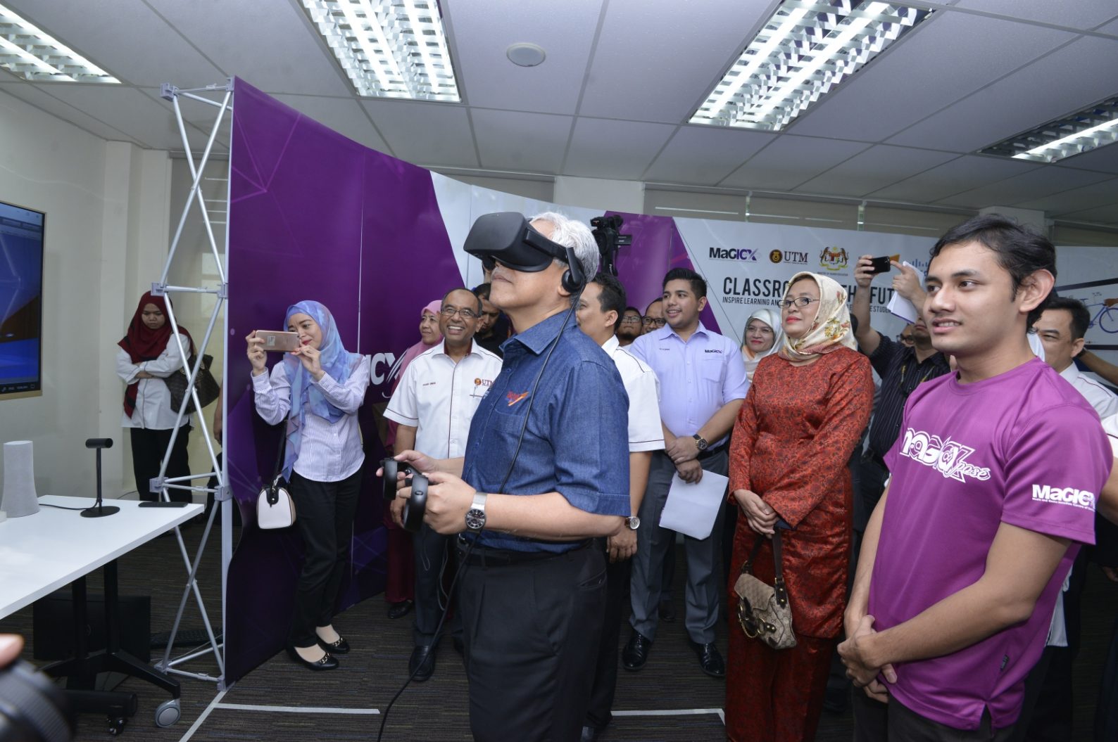
Launching Ceremony by Minister of Higher Education, Dato' Seri Idris Jusoh at MaGICX