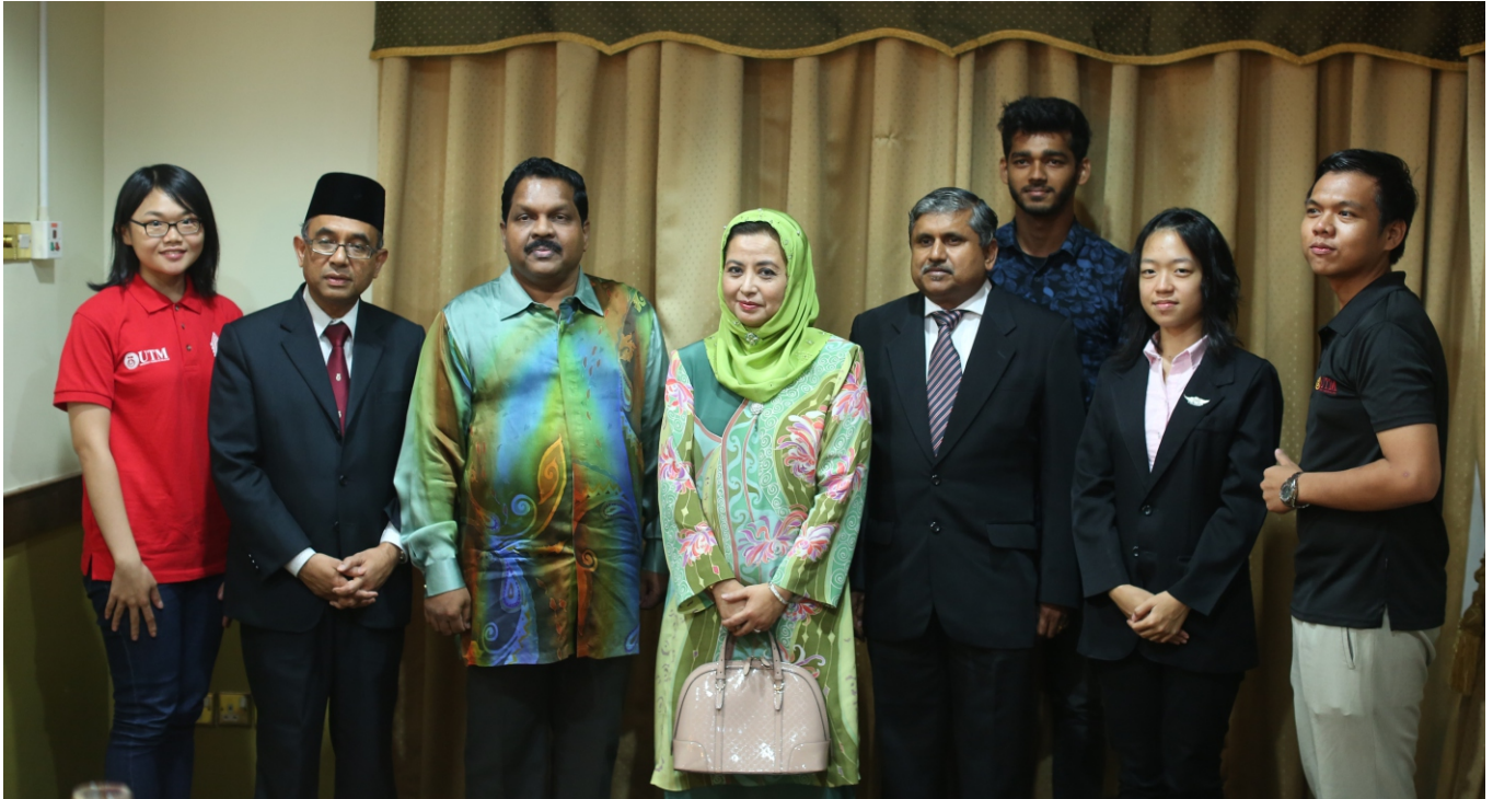
HM the Chancellor of UTM with the Vice-Chancellor (second from left) and participants

“ The Tuanku Chancellor English Language Club Sharing Session successfully attracted a large crowd from both domestic and international students from all disciplines. The students were all keen to share their experiences and opinions with HM Permaisuri Raja Zarith Sofiah. ”